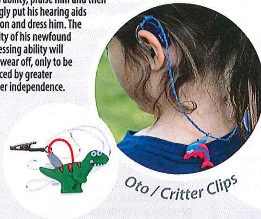
Oto / Critter Clips

Non-negotiable: Be persistent. Toddlers must learn that wearing hearing aids is non-negotiable.